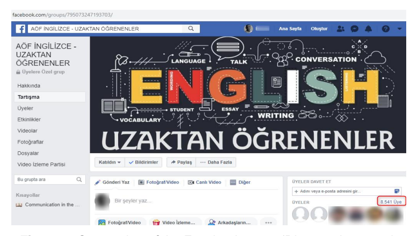
Figure 1. Screenshot of the Facebook group 'Distance Learners'.