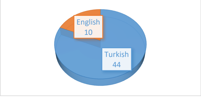
Figure 3. Language used in dissertations/theses

When the doctoral, proficiency of art dissertations and master's theses on virtual reality in Turkey are examined, it is found that the theses/dissertations are primarily written in Turkish as shown in Figure 3. 30 of the master's thesis, 12 doctoral dissertations and two proficiency of art dissertations have been prepared in Turkish. 9 of the theses prepared in English are master's thesis, while 1 is a doctoral dissertation.